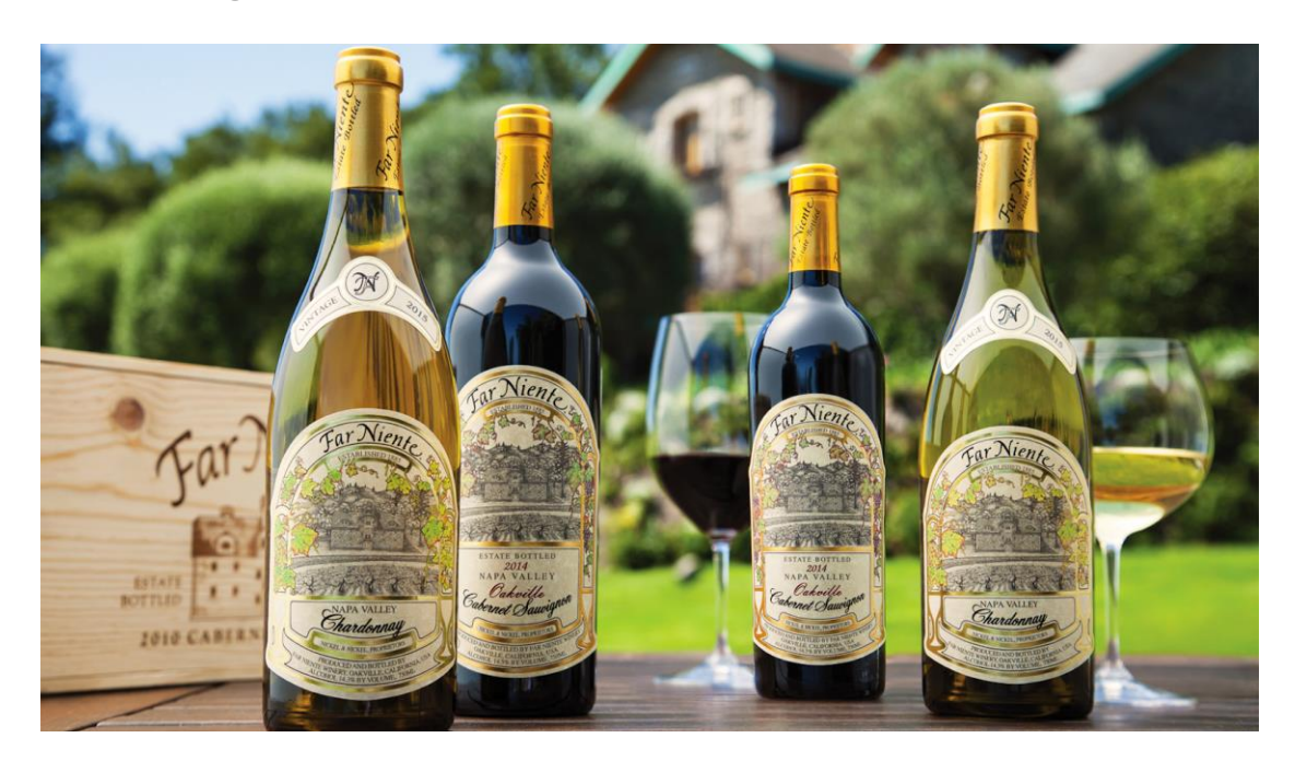
DEDICATED TO EXCEPTIONAL WINEMAKING, FAR NIENTE PAIRS HOUSE STYLE, VINEYARD OWNERSHIP AND ENVIRONMENTAL SUSTAINABILITY TO CREATE AN ENDURING BLEND

Far Niente Estate Chardonnay and Cabernet Sauvignon are consistently recognized as benchmark Napa Valley wines in every vintage. A dedication to winemaking in its highest form, paired with a focus on house style, vineyard ownership and social responsibility, has established Far Niente as one of the world's great wine estates.