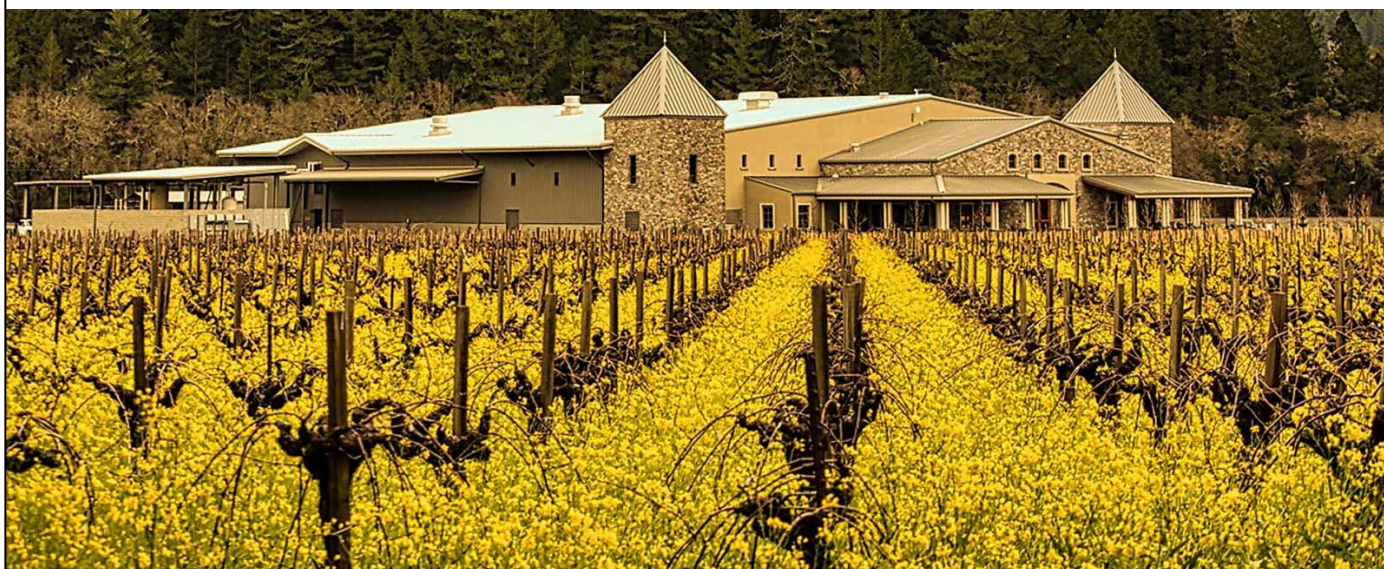
Girard has been based in Calistoga since 2018, but the winery uses Cabernet grapes from several Napa Valley subregions.

New reviews of Cabernets and blends from the top California region, up to 91 points